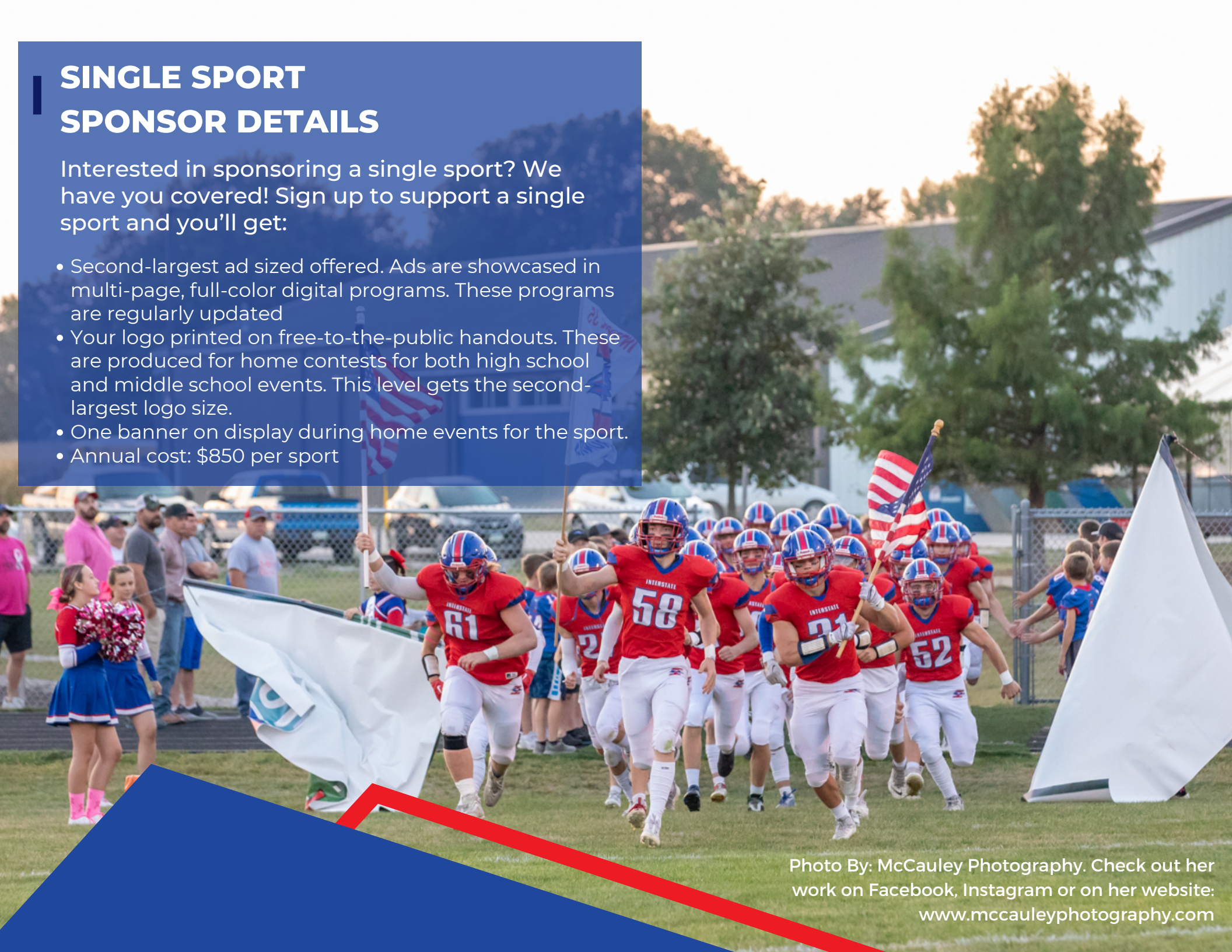
Photo By: McCauley Photography. Check out her work on Facebook, Instagram or on her website: www.mccauleyphotography.com